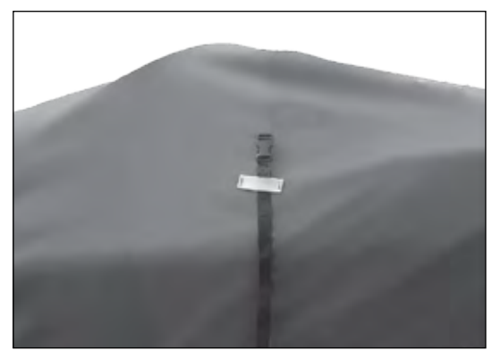
8. Thread Trailing Straps through Webbing Strips and around boat. Tighten. (Webbing strips located at intervals on top of cover).

NOTE: Due to product upgrdde, please refer to these instructions when fitting your cover.