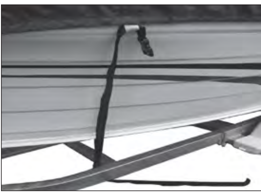
3. Thread Tie-down through Webbing Loop and around Trailer. (webbing loops sewn at intervals around cover edge.)