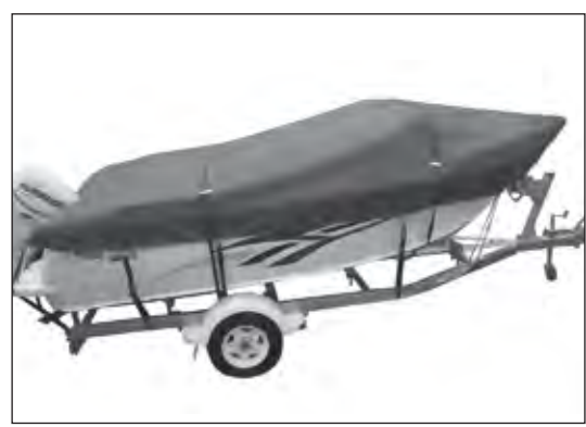
7. Tighten all Buckles.