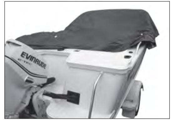
2. Fit front end of cover over Bow and unroll over Boat.