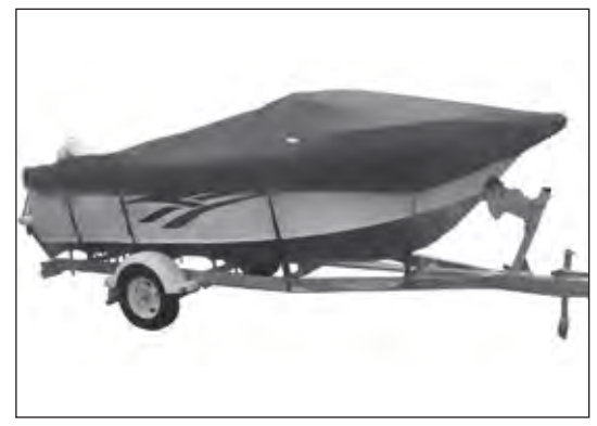
5. Repeat steps 3 & 4 on all Webbing Loops.