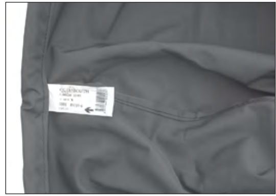
1. Locate front of Cover. (Tag indicates front.)

NOTE: Number of Tie-downs will vary according to the size of your cover.